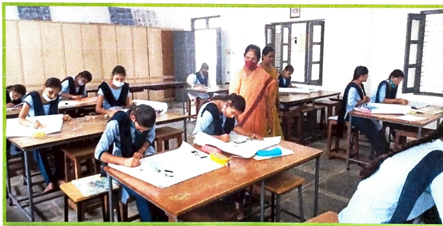
Intra Collegiate Competition on Drawing in College Botany Lab

An Intra Collegiate Competition on Drawing was conducted on 18 th November 2022 on RRR (Reduce - Reuse – Recycle) Model of Waste material and Short Film and Advertising Film on Solid Waste Management, Sanitation and Cleanliness was taken place from 18 November 2022 to 21 November 2022.