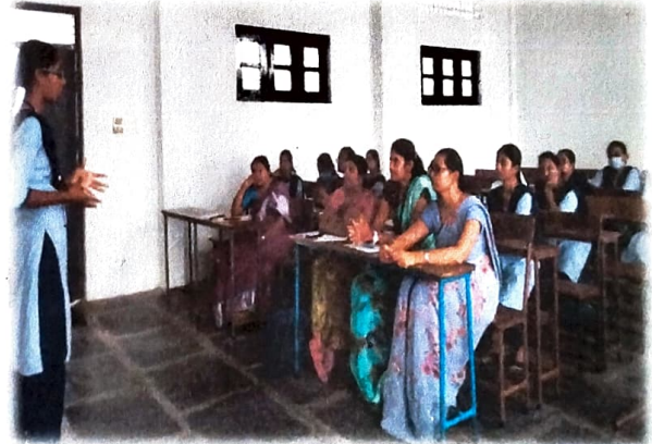
Essay Writing & Elocution Competition- Solid Waste Management